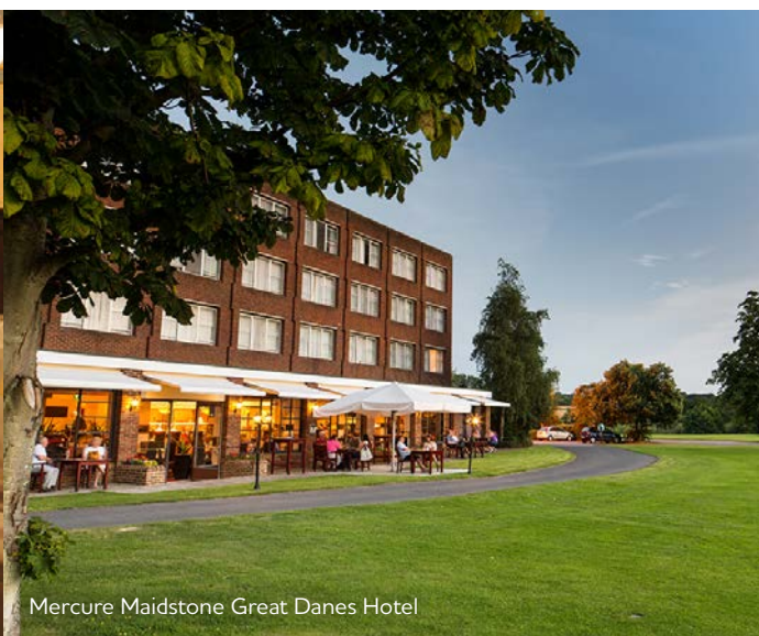
Mercure Maidstone Great Danes Hotel