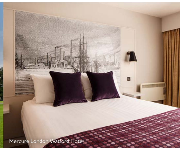
Mercure London Watford Hotel